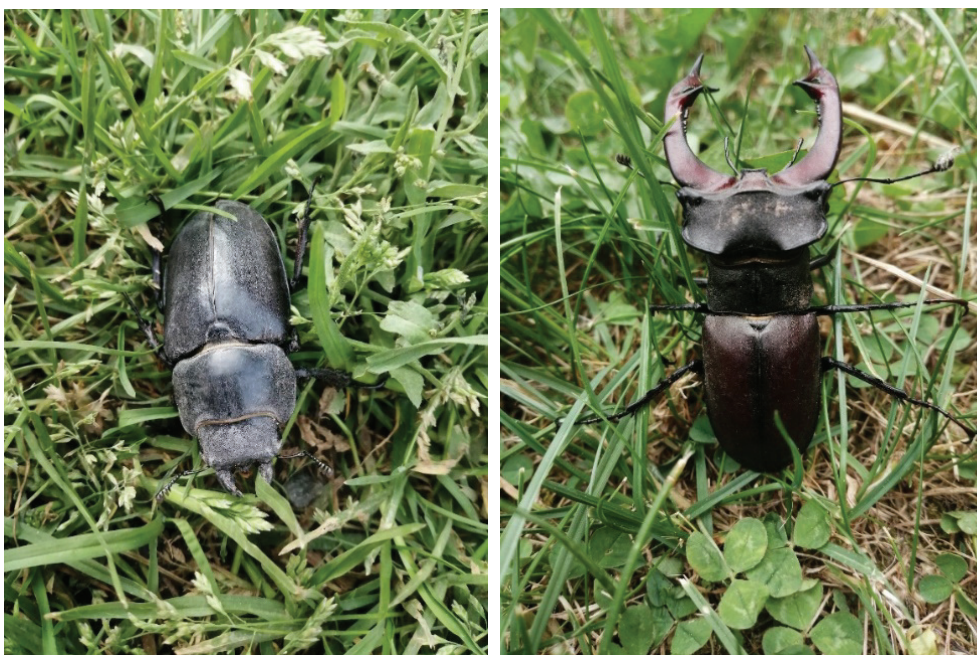
Figure 3. Lucanus cervus in the garden of Sibiu city (original photo).

The specimens were recorded also on May 18, 2020, when a couple was noticed in a garden in Sibiu, in the grass. The male was trying to locate the female. At the end of June, 2020, five specimens were recorded on a plum-tree stump (Fig. 3).