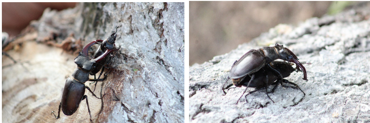
Figure 2. Lucanus cervus in Dumbrava Sibiului forest, Sibiu county (original photo).