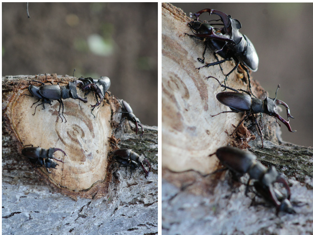
Figure 5. Lucanus cervus in the garden of the Geoagiu town, Hunedoara county (original photo).

The recorded specimens were collected from a garden in the town of Orăștie. The survey took place at 19.00 hours, when the 3 specimens were sitting on a plum-tree trunk. The two males courted the female with a view to mating.