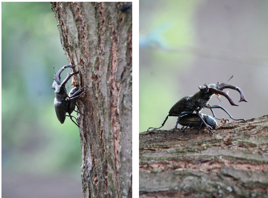
Figure 4. Lucanus cervus in Supărățel forest, Sibiel village, Sibiu county (original photo).

The forest of Supărățel is a forest of deciduous trees, in the western part of the village of Sibiel with the following tree species: Quercus petraea , Carpinus betulus , Fagus sylvatica , Acer pseudoplatanus , Sorbus aucuparia and Betula verrucosa (STANCĂ-MOISE, 2016).